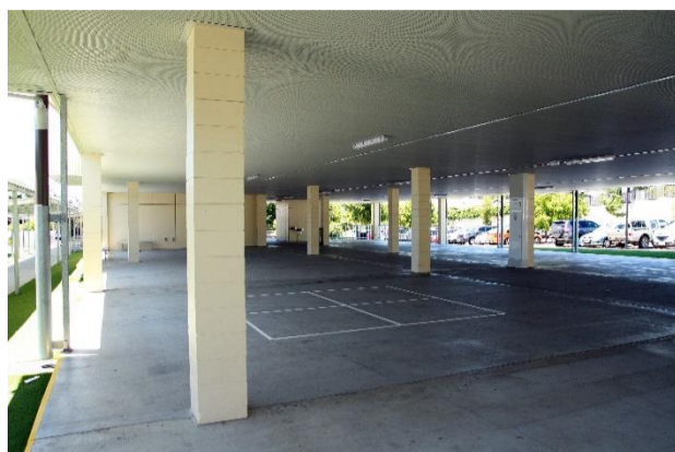
SLC Undercover Area