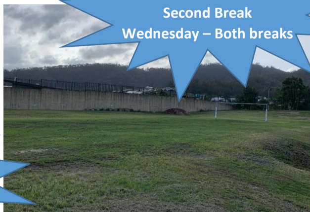
Soccer Oval (Behind the Hall)