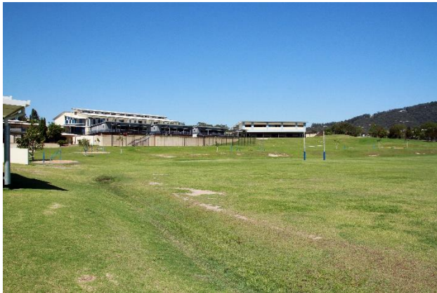
Oval – Left side