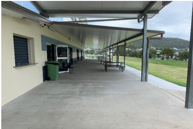
Outside the Hall