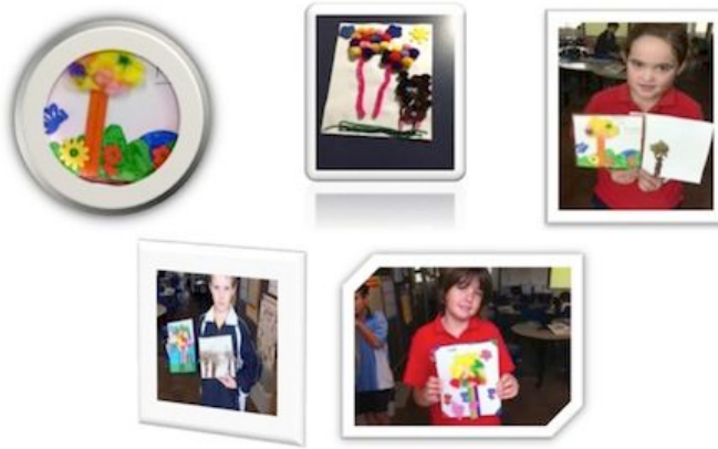
Students working on SOSE and Homework tasks